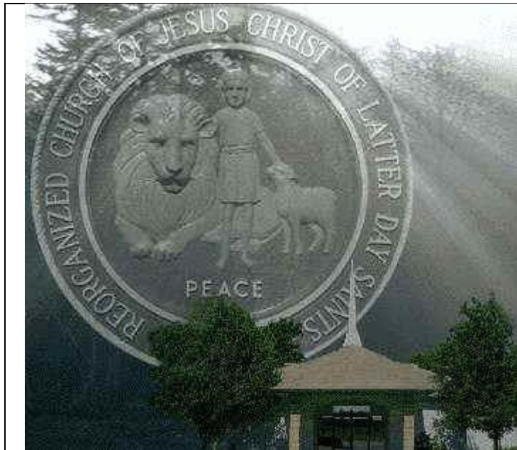
An earlier version of the RLDS seal superimposed behind the church's Modesto, California chapel.